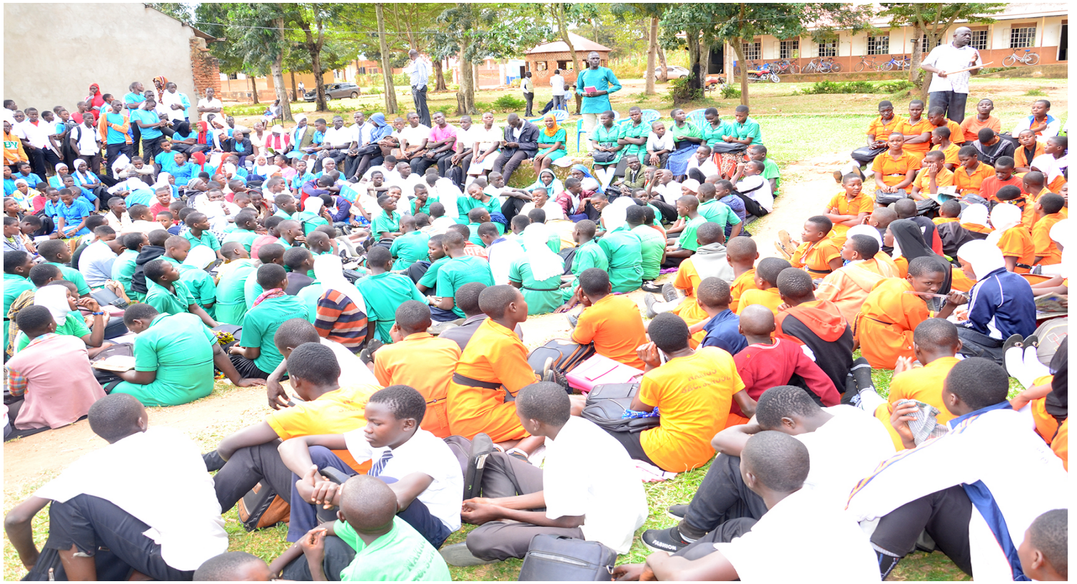
Figure 1: The Executive director participating in health talks at Nakigo Secondary School in line with the Megahit Health Organization ongoing projects.