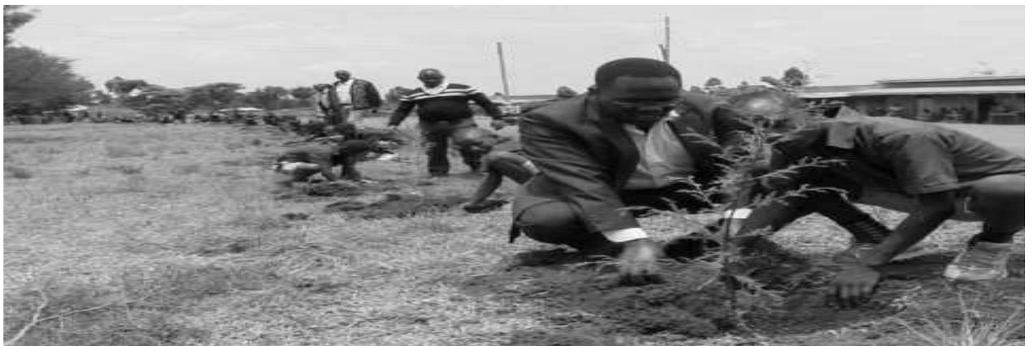
Figure 3: Megahit Health Organization participating in a tree-planting project at Bunama Primary School.