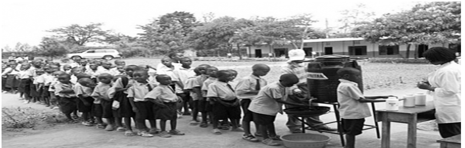
Figure 2: Megahit Health Organization conducting a deworming programme at Nakigo Primary School.